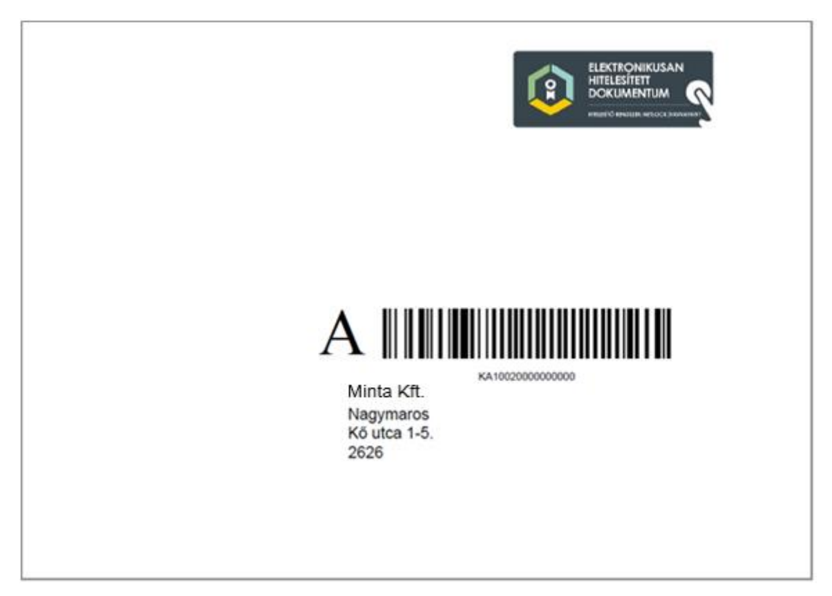
Figure 1 – Front page of delivery confirmation, specimen. The specimen indicates a fictitious company as the addressee.

Posta provides delivery confirmation to the sender through the requested channel. A certified paper-based delivery confirmation can also be requested for priority and non-priority registered domestic mail with advice of delivery, registered reply mail with advice of delivery, contractual registered discount direct mail with advice of delivery, discount direct mail, registered mail containing literature for the blind with advice of delivery and official documents. For this reason, the certified electronic and paper-based version of the delivery confirmation are both two-sided.